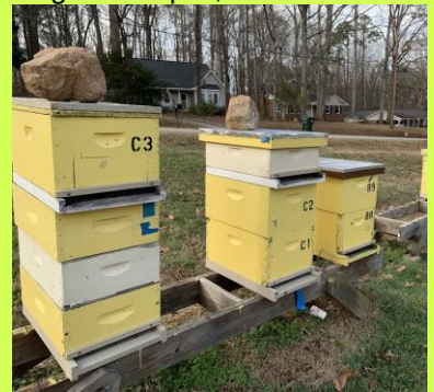
IMAGE shows two smaller colonies stacked with modified double screened bottom boards to allow them to get some residual heat from the ones below.

Lastly, it's a good idea to get a beginning of season mite count in. We usually cannot do this in February, but if we get long warm spell, I would take advantage of it if you're opening your hives.